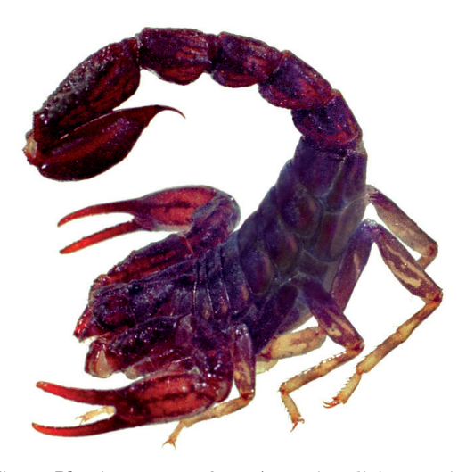
Fig. 2. Phoniocercus sp. from Argentina, living specimen in a defensive posture.

mixture of the soil and the fallen rocks. Only a sparse cover of grasses and annual herbs grew out of this rock rubble and poor soil. This steep hillside and roadway has full exposure to sunlight, and spans a distance of about one hundred meters. This open area exists between flatter stretches where there are well-developed forests, with Coihue (Nothofagus dombeyi (Mirb.) Oerst as the dominant tree. Caña Colihue (Chusquea culeou Étienne-Émile Desvaux), Arrayán Macho (Rhaphithamnus spinosus (Juss.) Moldenke), and Chilco (Fuchsia magellanica Lam.) form the dominant understory vegetation. Two of the scorpions were collected under rocks of 40 cm in diameter, and one from under a piece of dead tree trunk 1.5 m in length. In all three cases the animals were resting on the mineral soil, under the rock or wood. There was no elaborated, or excavated, tunnel leading from the resting place of the animal to the outside.